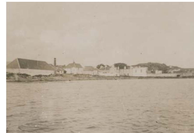
Distillery seen from Laphroaig Bay, 1910-1915.