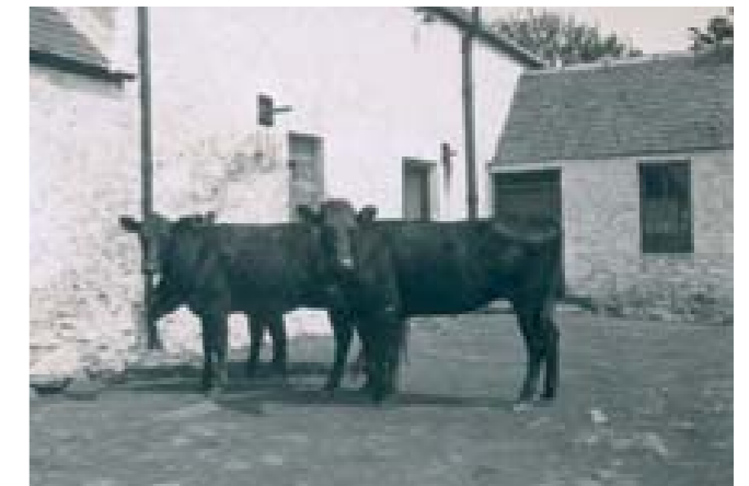
Cows on Laphroaig Farm, 1923.