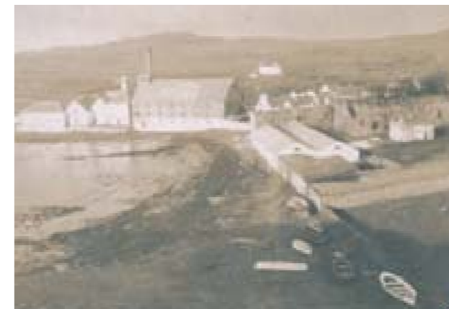
Laphroaig Distillery, 1923.