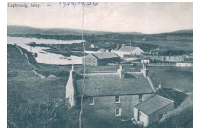
Laphroaig Distillery, 1924, as seen from Ardenistiel House.